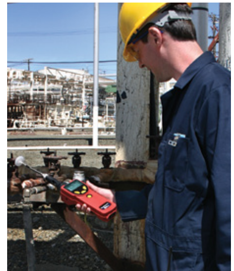
Workers can easily and quickly obtain VOC readings anywhere in the facility with the RAE Systems UltraRAE 3000