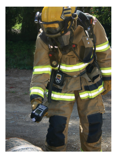
MultiRAE Pro with RAELink3 Mesh used for screening potentially hazardous drums