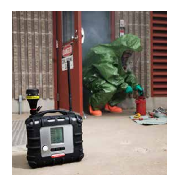
Don't know what you're walking into? Go from uncertainty to reassurance with the AreaRAE Pro, detecting more threats from a single device.