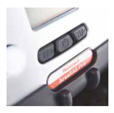
A USER-FRIENDLY INTERFACE

Despite its sophisticated capabilities, AreaRAE Pro is easy to operate — no Ph.D. required — and is available in multiple languages. Just turn it on and go. It also has big buttons that are easy to use with hazmat gloves.