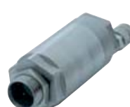
ACCTAP Air purge collar, available in anodized aluminium or stainless steel, for M12x1 sensing head