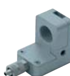
ACCTAPL Air purge collar laminar, for M12x1 sensing head