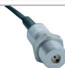
D08ACCTLST ACCTOEMLST OEM laser sighting tool, supply via CT electronic box or batteries