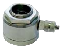
ACCTAPMH Air purge collar, for massive housing