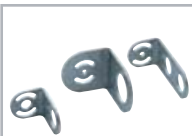
ACCTFB / ACCTFBMH / ACCTFB2 Mounting bracket, adjustable in one axis (M12x1-sensing head, massive housing, 2-hole for M12x1)