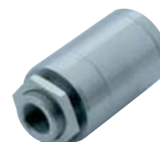
Massive housing, available in brass ( D06ACCTMHB ), anodized aluminium ( D06ACCTMHA ) or stainless steel ( D06ACCTMHS )