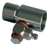
ACCSAP Air purge collar, for M12x1 sensing head