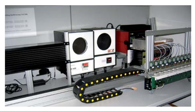
Automated calibration stations at Optris GmbH

Based on the LS-PTB, Optris produces the LS-DCI as a high-precision reference IR thermometer for its customers. The DCI units are produced with pre-selected components supporting a high stability of measurement. In combination with a dedicated calibration at several calibration points the LS-DCI achieves a higher accuracy than units from series production.