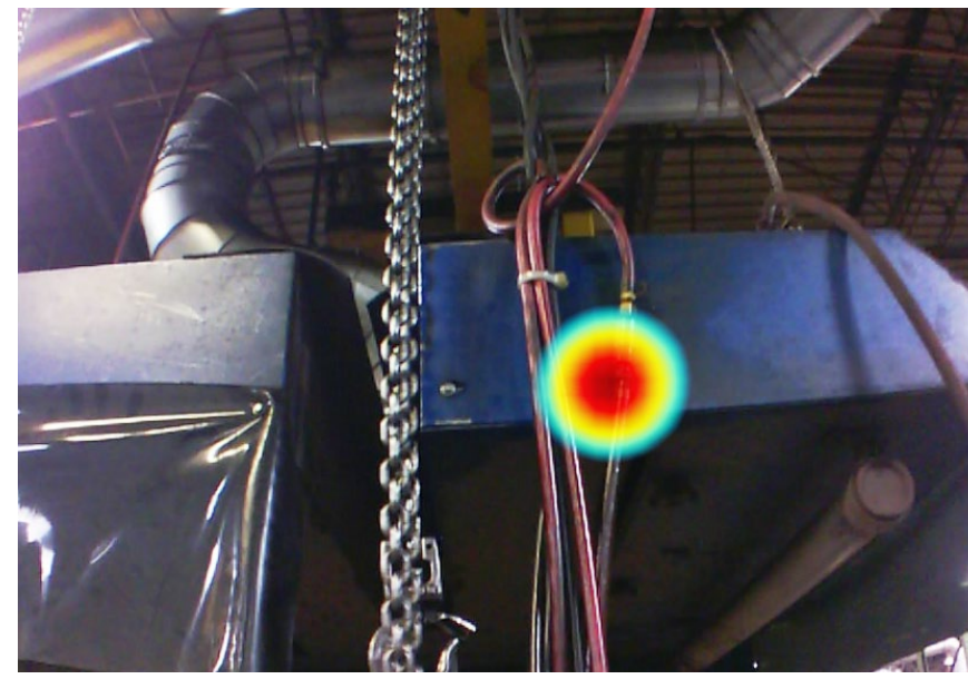
Images\ taken\ with\ the\ ii 900\ Sonic\ Industrial\ Imager\ in\ an\ industrial\ environment.

Fluke. Keeping your world up and running.®