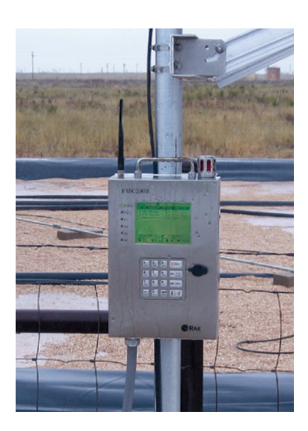
The FMC-2000 controller can monitor up to 24 wireless MeshGuard detectors and contains five programmable relays that can trigger external alarms or process controls.