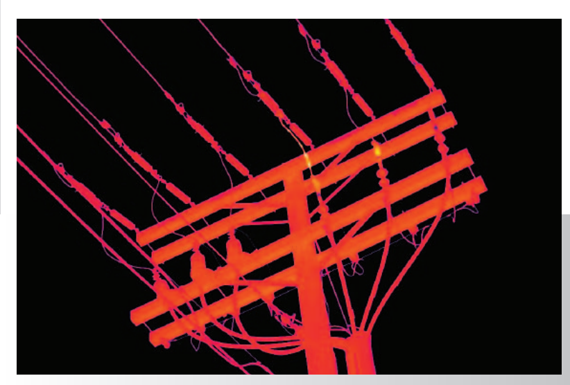
Electrical utility distribution lines

*HD images are captured by the TiX1000 in SuperResolution mode and viewable in the SmartView® software.